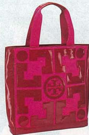
T PARTY: Tory Burch has a new S.D. address.

Fashion Valley meets the Upper East Side? I wanted a store that looked more like a room in my apartment than a typical boutique. We have bright orange walls, green carpeting, vintage chandeliers and white couches that make our stores feel unique and luxurious. Fave pieces for summer? I love the Dedra, a sleeveless, cream crochet dress we did that has a chartreuse underlay that peeks through, inspired by an old picture I saw of Lee Radziwill. And our cream and navy tie-dye cardigan. Wait, what? Tie-dye?! When I was a child I always used to make tie-dye with my brother. It will always be in style, anyone can wear it. You have a 30-pound luggage limit—what to pack? Layering is key so I pack a variety of cardigans and sleeveless shells. I love bold jewelry so I always bring a few necklaces and cuffs. Framed photographs of my boys make the hotel room feel more like home and are always in my suitcase. Global shop spots? Open-air bazaars. I recently visited Turkey with our design team and it was incredibly inspiring. There's a necklace that we're interpreting, with charms from every religion.