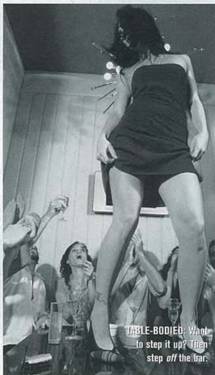
TABLE-BODIED: Want to step it up? Then step off the bar.