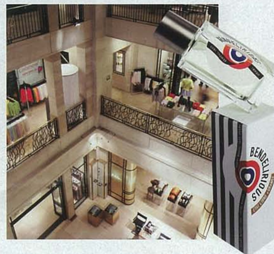
PARAMOUR

OH HENRI! In this fall's retail shocker, Henri Bendel has just opened in Fashion Valley . The first West Coast expansion from its N.Y. flagship, it's where a thousand air-kisses are bestowed daily and every socialite's dream comes true. For those catching up, here's a primer. First: Skip the French; it's pronounced "Henry." Two: There's no shoe department. Three: This location will carry gifts and accessories, including the new Bendelirious scent and the cult-status brown- and white-striped cosmetics bag.