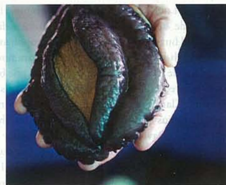
MOLLUSK MADNESS: At S.D.’s premier restaurants, abalone tops the seafood chain.