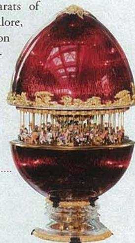
AROUND WE GO: At Carlsbad's Gemological Institute of America, the latest acquisition combines an S.D. tourist destination with major carats.

While the Hope Diamond celebrates its 50th anniversary (er, that's the "golden" one, right?) all eyes are on Carlsbad's GIA , that global go-to for everything lapidary, which graded the cursed blue rock. Now the GIA is giving its iconic, nearly one million-carat quartz chandelier a bit of competition with its newest sparkly marvel on display. The Fabergé-like Balboa Park Carousel Egg, which took 18 years to produce, packs 20 carats of diamonds, platinum galore, and a meticulous recreation of S.D.'s famed merry-go-round. Best part: It plays rockin' hits—like "Sweet Marie"—from the 1890s. "Sweet Marie"?! We are so there. www.gia.edu .