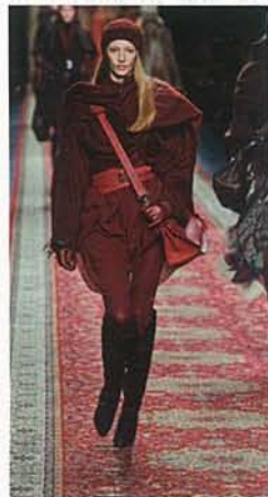
FRENCH LESSON From top: The Hermès flagship in Paris expands its reach to Fashion Valley; a cool-weather look from Hermès.

[THE ARRIVAL] HERMÈS-MERIZED! Horse-mounted Parisian cherubs in heaven, blow your horns: Hermès is almost here! The storied, nearly 200-year-old French fashion house is expected to arrive at Fashion Valley later this month—or early next month—and we will soon be seeing those unmistakable orange boxes everywhere. It brings with it its utterly timeless leather goods, five-figure Kelly bags, those iconic graphic hostess trays, and, thanks to Jean Paul Gaultier at the reigns, a “cowgirl” theme for spring. (And yes, that means fringed Birkins.) It also brings its history of luxury-on-steroids equestrianism that is simply matchless. The Rancho Santa Fe set? Pardon the pun, but they’re champing at the bit. In honor of its S.D. arrival, Hermès has even released an exclusive beach towel in electric hues with a zebra design as a nod to our zoo. We can’t wait for the grand opening, because this grande dame knows how to let her hair down: Last year’s re-opening of its 24 Faubourg flagship featured a 24-hour fête that included a gospel performance, a full-on nightclub, Indian musicians, and, in the morning, breakfast and yoga. Start working those connections now for an invite.