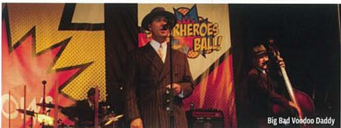
Big Bad Voodoo Daddy