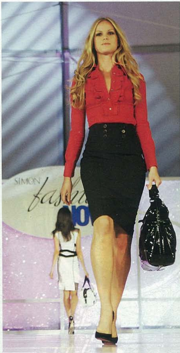
In the Now!