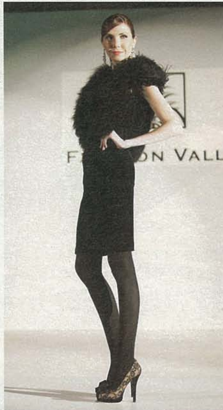
The new black!