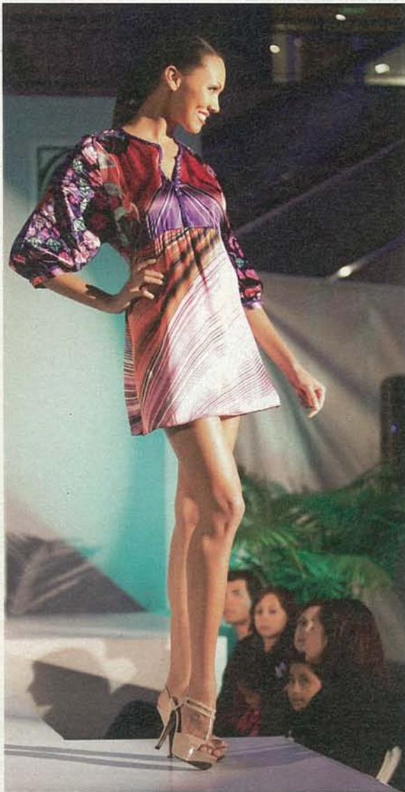
Meow: On the catwalk!